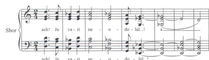
Example 14 Kaprálová, Ilena , op. 15, part IV, chorale.

Here Kaprálová modified the text slightly, for Podjavorinská’s original says “ oh, he won’t be able to resist . . .! ” This small alteration (by Kaprálová) suggests that the youth has already been damned, while the original still gives him a chance, albeit negligible, to escape his damnation. Kaprálová also omits six